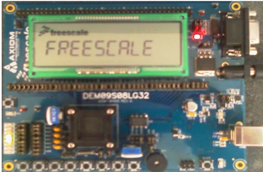
Figure 1. MC9S08LG32 Demo Board LCD Setup