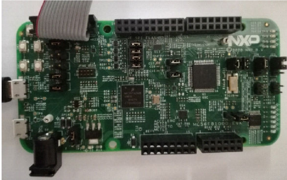
Figure 1. MC56F81000-EVK development board configured for an external debug probe